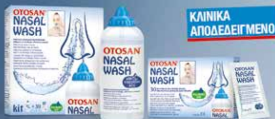
Otosan® Nasal Wash KIT: Φιάλη + 30 φακελάκια